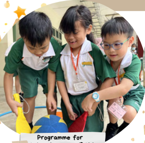
Programme for Active Learning (PAL) Sports & Games

We encourage our students to dream big, stay resilient, work hard and enjoy the journey. Opportunities are created for students to discover their strengths, realise their potential and showcase their talents during their 6-year journey in Greendale Primary School.