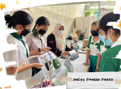
Malay Finesse Fiesta