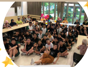
Visit to Old Folks' Home