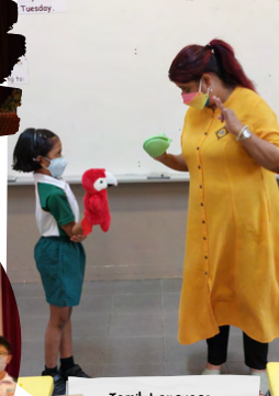
Tamil Language Fortnight