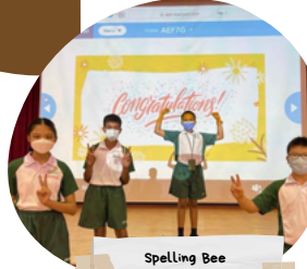
Spelling Bee Competition