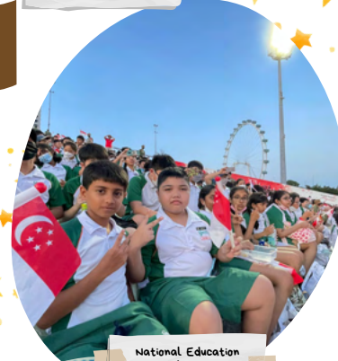
National Education Show