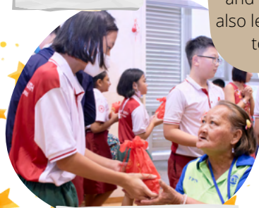
Seniors from Lion Befrienders receiving goody bags during the school's Chinese New Year celebrations