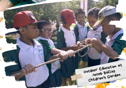
Outdoor Education at Jacob Ballas Children's Garden