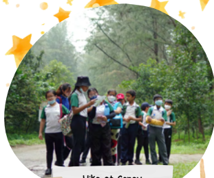
Hike at Coney Island

'The more curious a child is, the more he learns.' We believe in nurturing our students' curiosity and communication skills. Our students' learning goes beyond the classrooms when they participate in the school's overseas and local learning journeys.