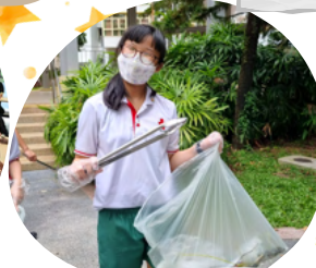
Values in Action Project