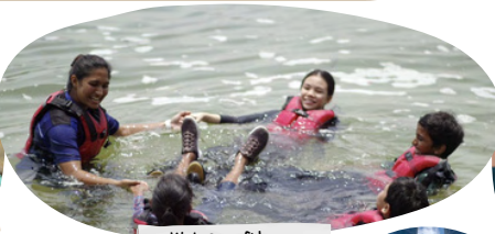
Water confidence test to prepare for Dragon Boating