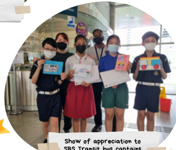
Show of appreciation to SBS Transit bus captains & station staff